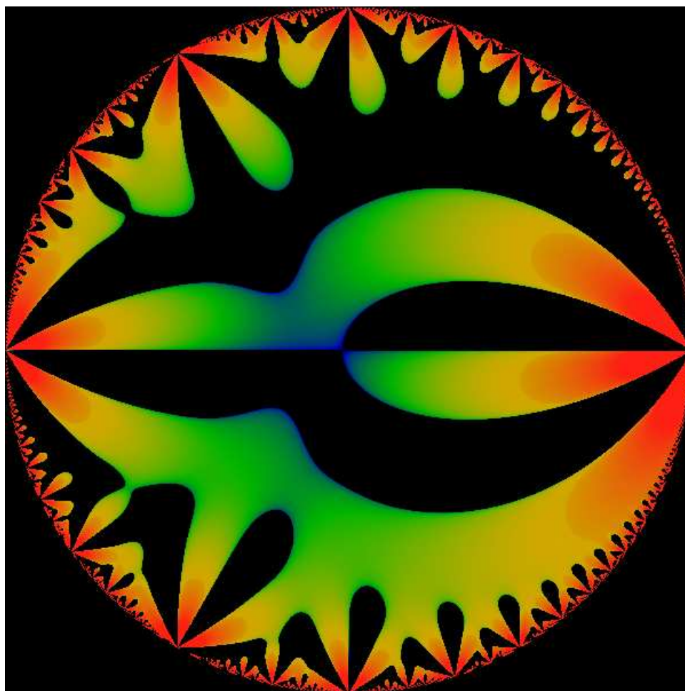
FIGURE 8.3. Graph of the modular invariant g_3 .

This figure shows the imaginary part of the modular invariant g_3 , one of the invariants of an elliptic curve. Specifically, it shows the imaginary part of