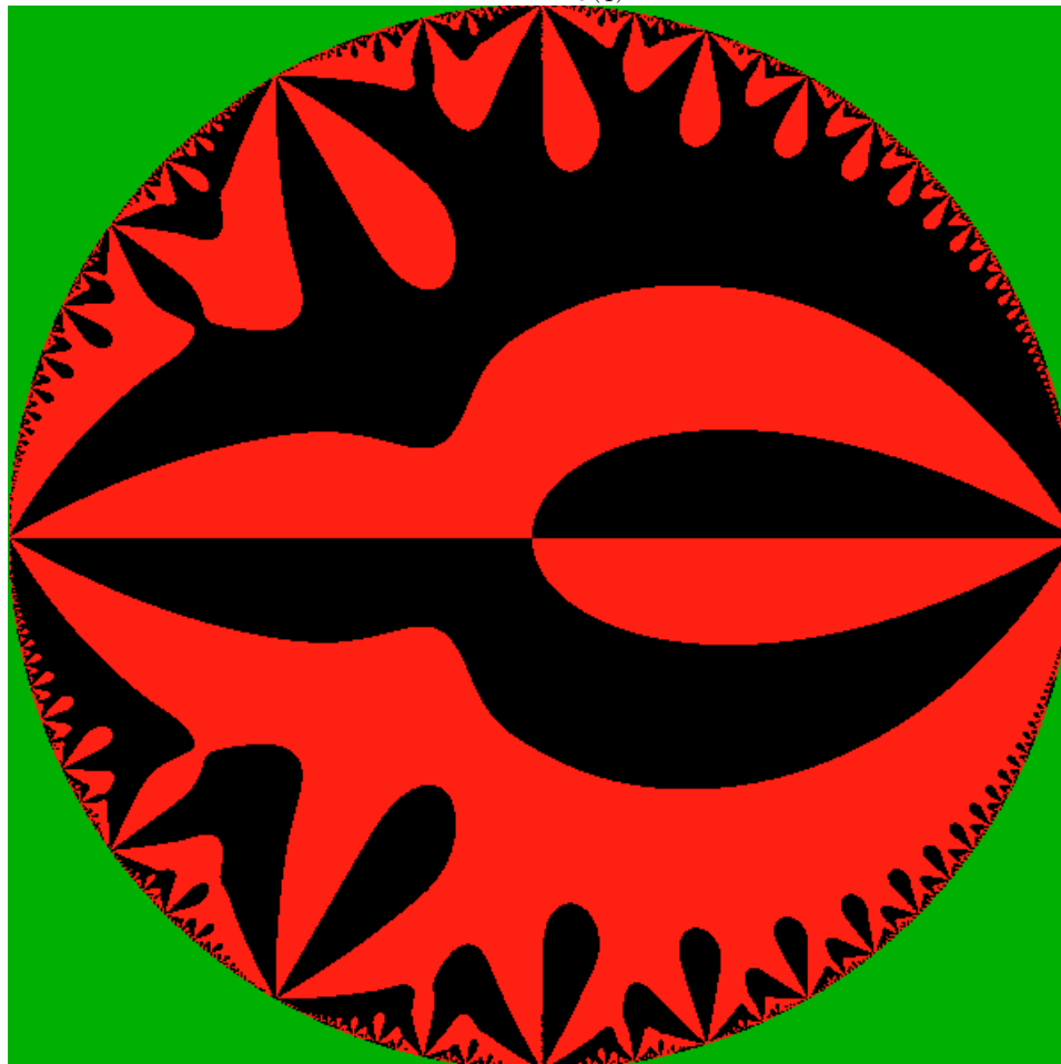
FIGURE 8.2. Phase of P_{-5}(q) on the unit disk