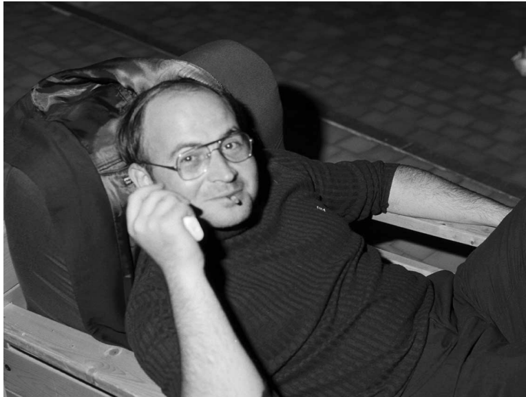
FIGURE 1. Henri Meyniel in Aussois, France, in the 1980’s.

We will refer to (1.1) as the Meyniel bound . The conjecture was mentioned in Frankl’s paper [15] as a personal communication to him by Henri Meyniel in 1985 (see page 301 of [15] and reference [8]; see Figure 1 for a rare photograph of Meyniel). Despite this somewhat cryptic reference, Meyniel’s conjecture stands out as one of the deepest (if not the deepest) problems on the cop number. The conjecture was largely unnoticed until recently, with several new works supplying upper bounds to the cop number or solving partial cases; see [4, 10, 16, 18, 26, 28]. One of the motivations of this survey is to summarize what is currently known on the problem, while supplying the requisite background for researchers to consider its aspects (and solution!) in the future.