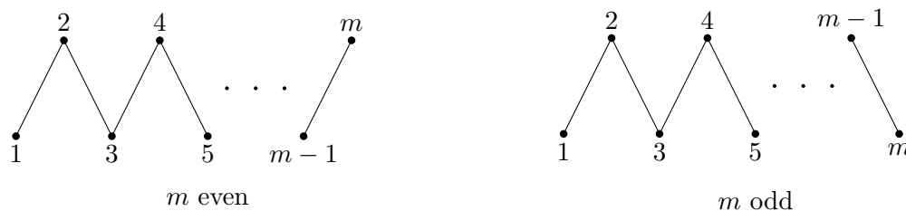
Figure 1: The zigzag poset Z_m .

Let \mathbf{n} be the poset on [n] with its usual order ( \mathbf{n} is a linearly ordered set). The m -element zigzag poset, denoted Z_m , is shown schematically in Figure 1. Note that the order <_{Z_m} in Z_m is 1 < 2 > 3 < 4 > 5 < \dots . The definition of the order \leq_{Z_m} is self-explanatory.