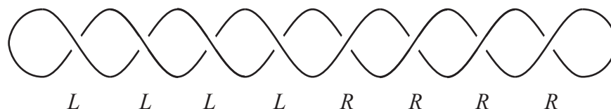
FIGURE 1. The TWYST-OFF position (4, 4) is equivalent to the position (4, 4) in WYTHOFF