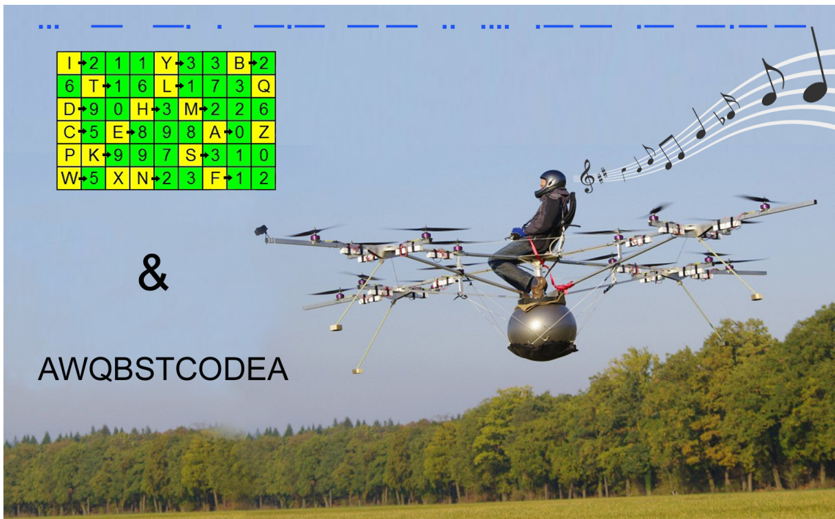
Figure 2: Illustration for the problem “A music lover”

As usual Alex listens to music on the way to university. He chooses it applying one secret code to the second one in his mind (Figure 2). Could you understand what music he is listening to right now?