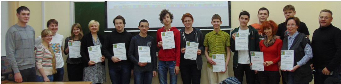
Figure 4: Awarding ceremony at Novosibirsk State University, December 2017.

Here we list information about the winners of NSUCRYPTO-2017 (Tables 5, 6, 7, 8, 9, 10).