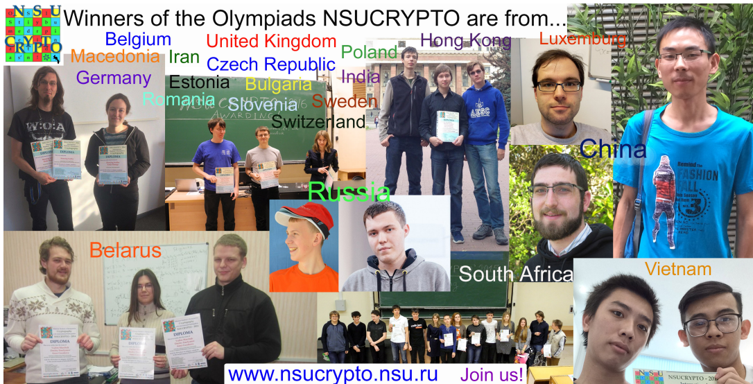
Figure 5: The NSUCRYPTO winners of different years.