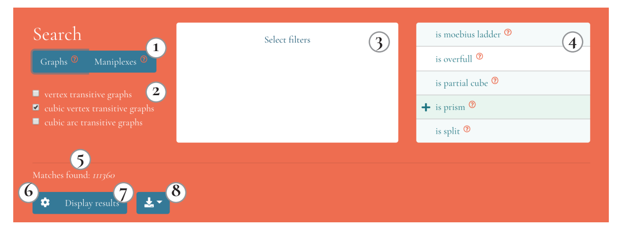
FIGURE 6. Search box

We will describe the website functionality on Use case 1. The census of cubic vertex-transitive graphs on up to 1280 vertices [27] contains (among others) all graphs Tilen is interested in on up to 1280 vertices.